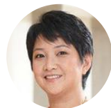
Bi Yong Chungunco* ●